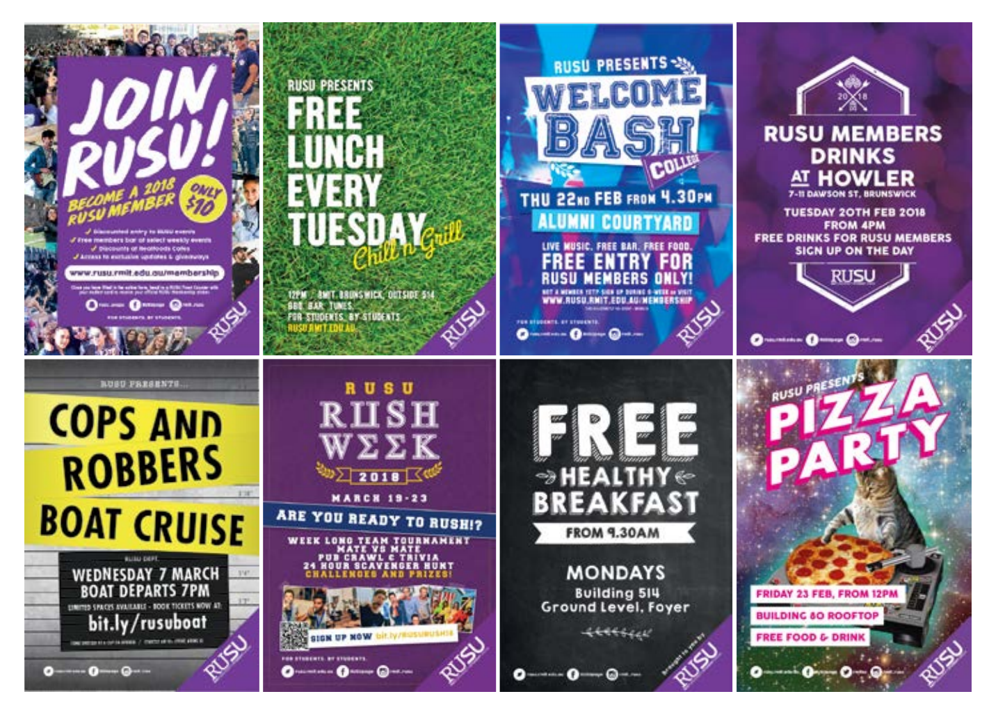
Above: RUSU promotional posters for a variety of events